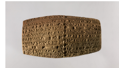
Cuneiform cylinder with inscription of Nebuchadnezzar describing the construction of the outer wall.

"I built a strong wall that cannot be shaken with bitumen and baked bricks... I laid its foundation on the breast of the netherworld, and I built its top as high as a mountain... The fortifications of Esagila and Babylon I strengthened and established the name of my reign forever."