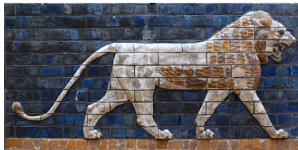
Lion of Babylon, Ishtar Gate

"But Daniel resolved that he would not defile himself.." (v 8)